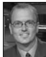
Scott Van Pelt